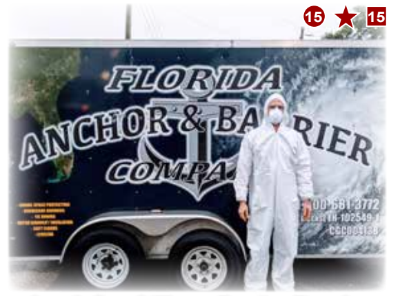
Insulation & Vapor Barrier Repairs Soft Floor Repairs & Laminate Flooring

As a company, we want your business and there is no need for any contact if you so choose. Our business is deemed an "Essential Business" and we are here for you when you need us. You can schedule your inspection by calling 1-800-681-3772.